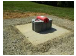
Livestock Watering Facility installed with grant funds

The 319 Grant Program is on track and progressing well. Almost all funds have been committed to projects in the three counties of Stokes, Rockingham and Caswell. The following best management practices have been installed from 319 grant funds in Stokes County at this time: 178.6 acres of cropland conversion (primarily old fields to grass), 81.4 acres of no-till soybeans, 4 watering facilities and 1 well. Upcoming work this year will include livestock exclusion fencing, more watering facilities, field borders, grass waterways, and a community conservation project ♦